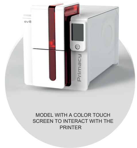
MODEL WITH A COLOR TOUCH SCREEN TO INTERACT WITH THE PRINTER