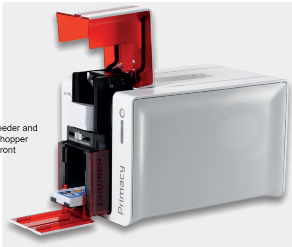
Card feeder and output hopper at the front